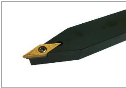
Right hand shown