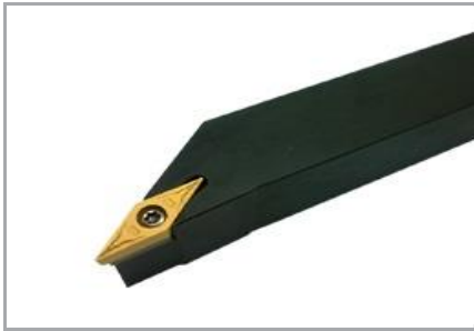
Right hand shown