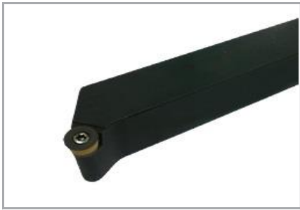
Right hand shown