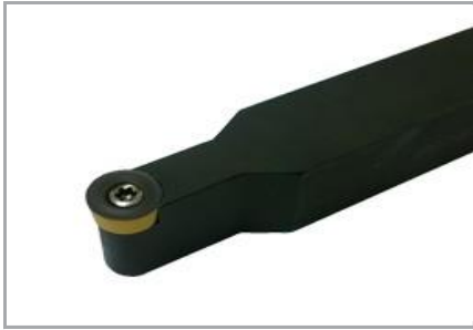
Right hand shown