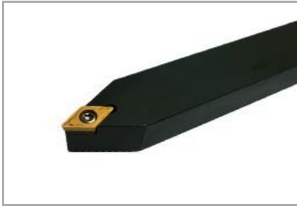
Right hand shown