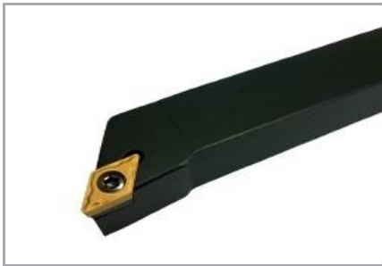
Right hand shown