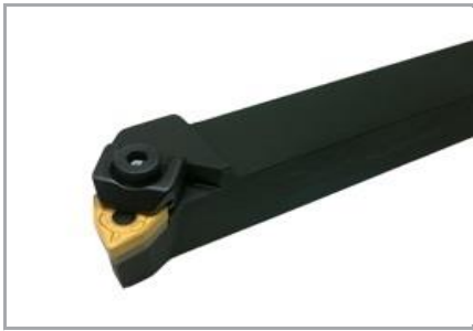
Right hand shown