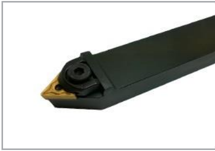
Right hand shown