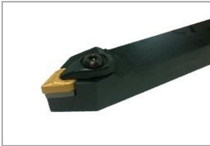
Right hand shown