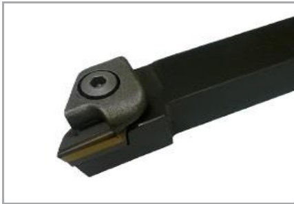
Right hand shown