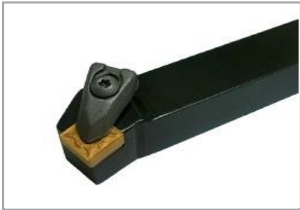
Right hand shown