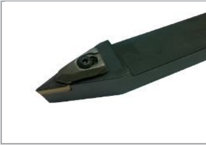
Right hand shown