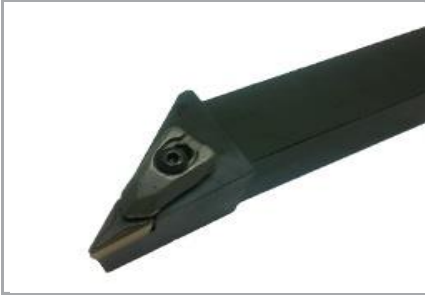
Right hand shown