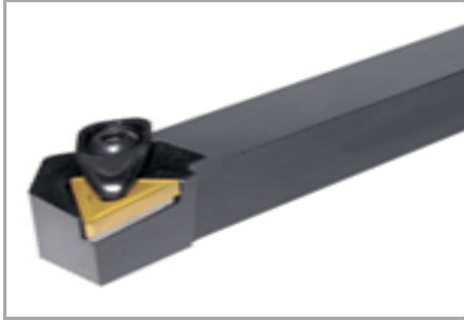
Right hand shown